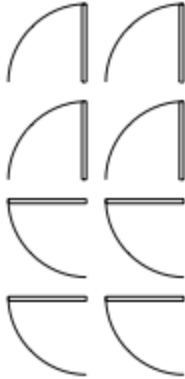
Standard Doors Layers: BuildingEnvelope (entrances) and InteriorWallsAndDoors (interior doors)